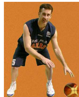
4: Speed dribble (L)