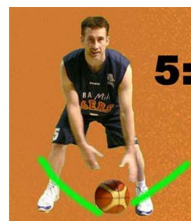
5: Cross-over dribble